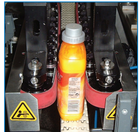
▲ A bottle of fabric softener passes through the compression belts of the T4000-C.

The purpose of this test was to prove the effectiveness of the TapTone 4000-C Compression Sensor in testing plastic household chemical bottles for proper closure and seal defects. Due to the nature of liquid household chemicals, processors are aware that one leaking container can ruin an entire case of product. Detecting leaking containers just outside the capper also prevents downstream equipment from being contaminated with leaking product. The T4000-C Compression Sensor is ideal for finding potential leakers in household chemical containers before they leave the processing plant.