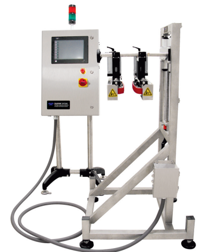
▲ T-4000 Controller and Compression Sensor. Sensor has a cantilever design that suspends over the existing conveyor.

The T4000-C Compression Sensor utilizes dual parallel belts to apply force to the sidewall of a passing container. This action also compresses the headspace of the container which allows a sensor to take a pressure measurement at the discharge of the system. Utilizing DSP technology, the controller analyzes the measurement and assigns a merit value to each container. If the merit value is outside of the acceptable range, a reject signal activates a remote reject system.