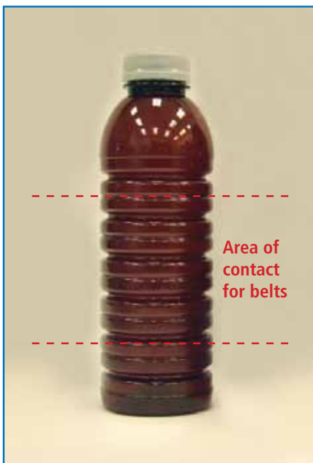
Figure 1 is a hot filled juice container with horizontal rings around sidewall. This container could be squeezed anywhere in the mid-section as indicated by the dotted lines. (When inspecting hot filled containers, it is best to inspect while the container is hot. This topic will be covered in more detail in Part -3 of this series.)

In a perfect world all containers would have straight sides with no shapes or contours to interfere with the inspection. In reality, very few applications involve this type of container. Most containers are designed with some contour on the sidewall of the container. Some containers have a narrow mid-section others have a bulbous mid-section. Some containers will have vacuum panels or retort panels in the sidewall to allow the container to keep its shape once the container draws a vacuum. Containers can have rigid corners or hand grips in the sidewall designed to make the container easier to hold.