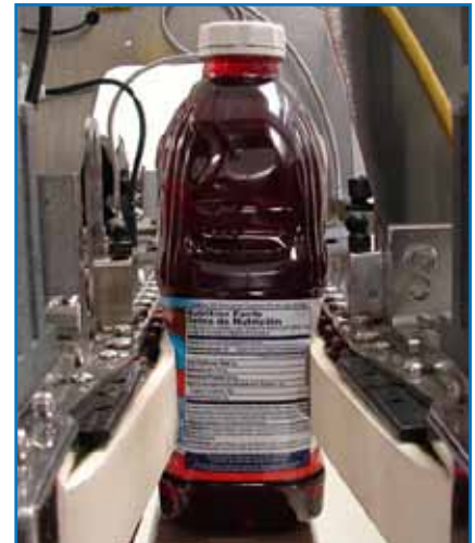
A bottle of juice passes through a TapTone 4000-DSC.