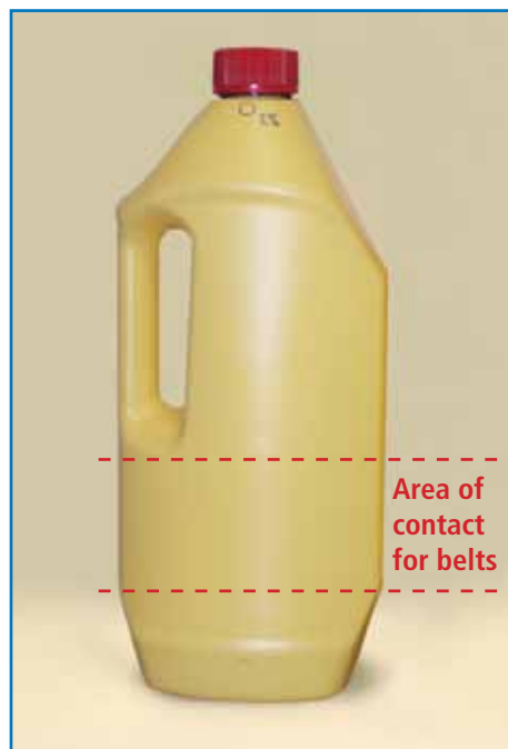
Figure 2 is an industrial chemical container. The handle has a rigid edge that would interfere with the inspection. The bottom of the container has a uniform flat surface where the compression belts can contact the container as indicated by the dotted lines.