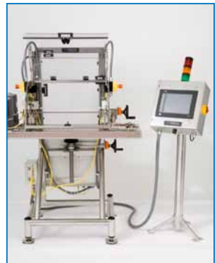
T4000 Dual Sensor Compression (DSC) System. Sensor has a cantilever design that suspends over the existing conveyor.

Utilizing advanced DSP technology the T4000 controller analyzes the comparative measurement and assigns a merit value to each container. If the merit value is outside of the acceptable range, a reject signal activates a remote reject system.