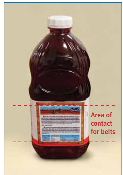
Figure 3 is a juice container with a multi-contoured body wall in the top half of the container. The bottom section of the container presents a large area for the compression belts.