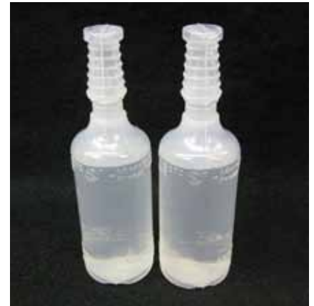
Flexible containers (pharmaceutical saline) also suitable for inspection on the T4000-DSC-LP.

Teledyne TapTone has modified the inspection capabilities of its most popular T4000-DSC system with a Low Profile (LP) transport deck that is designed to meet the challenges of testing these smaller, low profile packages for leaks.