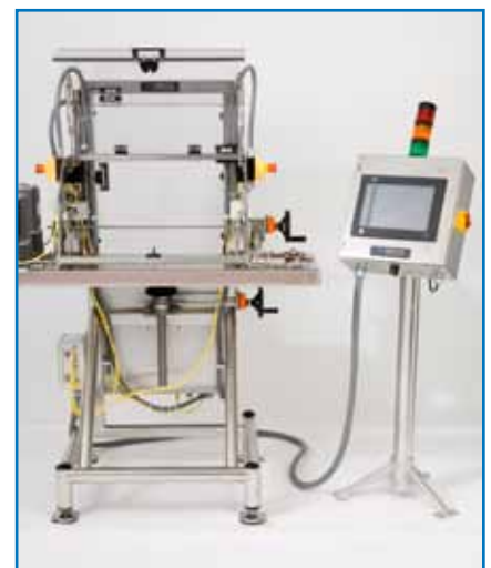
T4000-DSC-LP Low Profile Dual Sensor Compression System. Sensor has a cantilever design that suspends over the existing conveyor.

Utilizing advanced DSP technology the T4000 controller analyzes the comparative measurement and assigns a merit value to each container. If the merit value is outside of the acceptable range, a reject signal activates a remote reject system.