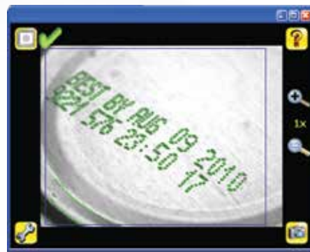
Can end with date code