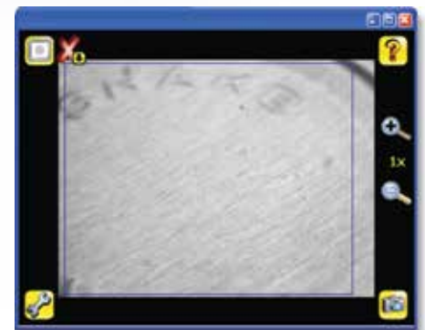
Can end missing date code